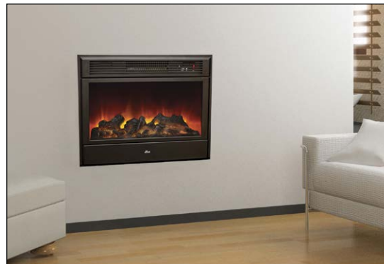
FEF26 - 26" Englewood Fireplace