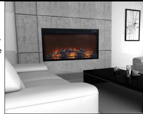
LEF36 - 36" Euclid Linear Fireplace

Each fireplace features colorful, random dancing flames and modulating coal bed with a mature-fire presentation of finely detailed logs. Select models feature patented Micro-Brite™ LED technology using 75% less electricity than other electric fireplaces. And to top it off, you never have to buy or replace light bulbs.