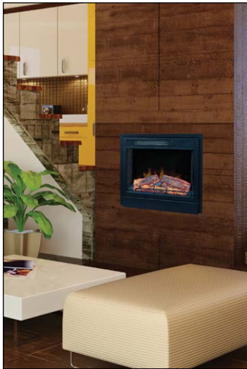
FEF18 - 18" Englewood Fireplace