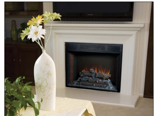
FEF32 - 32" Englewood Fireplace

Features include a hand-held remote control with storage nook built into the fireplace. Each fireplace also features a 5,000 BTU heater and adjustable flame, ember bed and ambient lighting controls. And since there's no gas, no flame, and no flue emissions of any kind, Fmi electric fireplaces are certainly the safest, and arguably most convenient to use of all fireplaces. Just hit the remote button for your total hearth enjoyment.