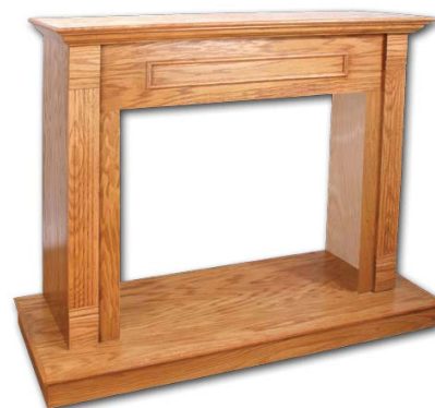
Vantage Hearth 36" Cabinet Mantel with Oak Finish