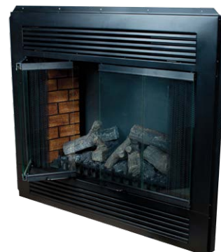
Premium 36" Electric Fireplace

*All cabinet mantels require some assembly.