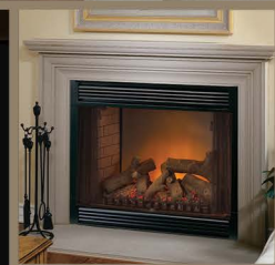
Premium Traditional Series