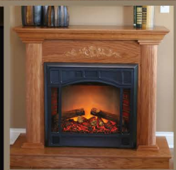
Compact Traditional Series