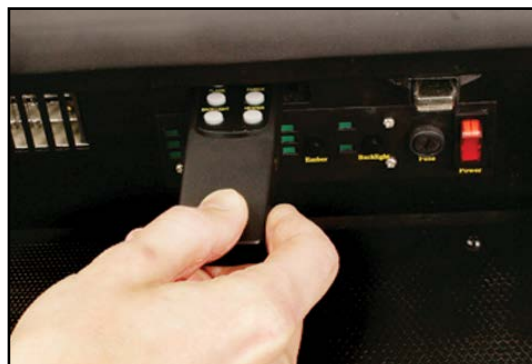
26" & 36" fireplaces feature a convenient storage nook for the remote control.