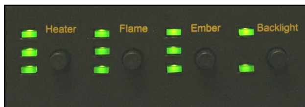
All Electric Fireplaces come with Clear LED control panel lights.