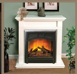
Mini Traditional Series