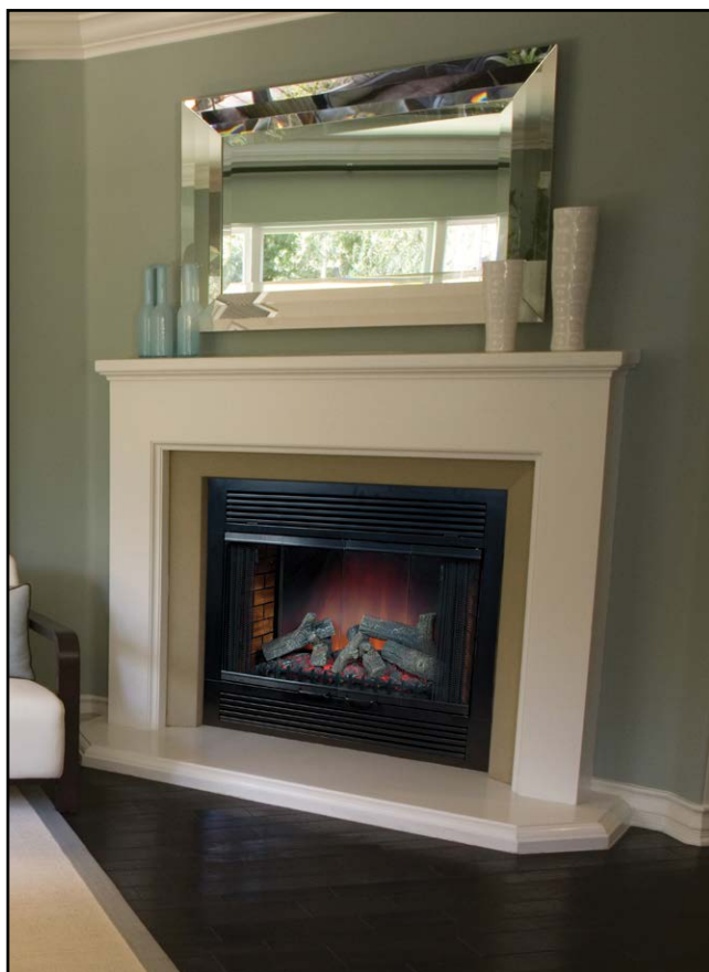
Premium 36" Electric Fireplace with bi-Fold glass doors.