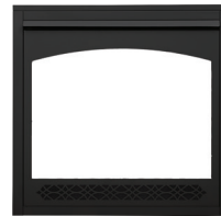
Heritage Decorative Front