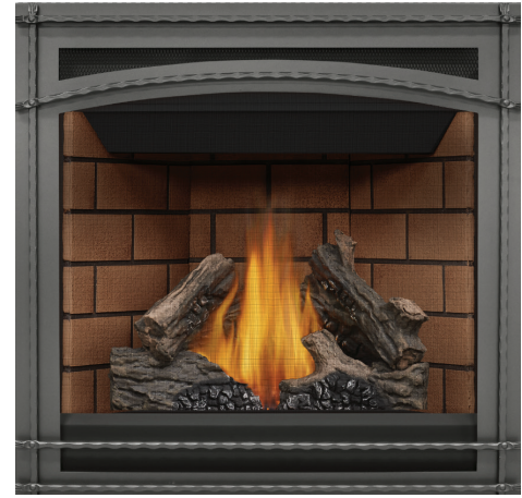
Wrought Iron Front X36WI