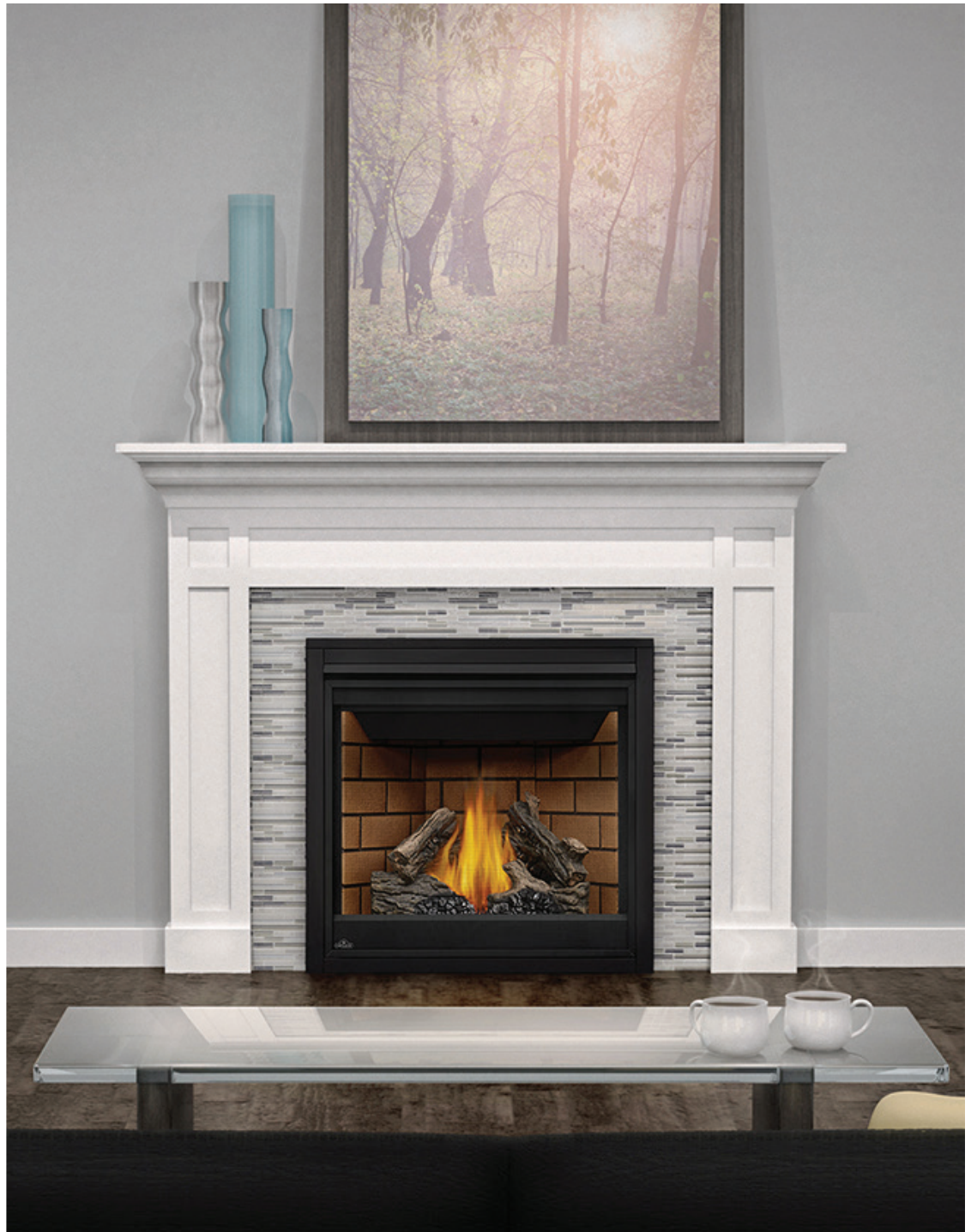
Ascent X 36 shown with sandstone decorative brick panels