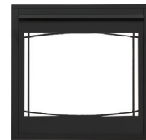
Zen Decorative Front