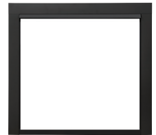
2" Trim Kit