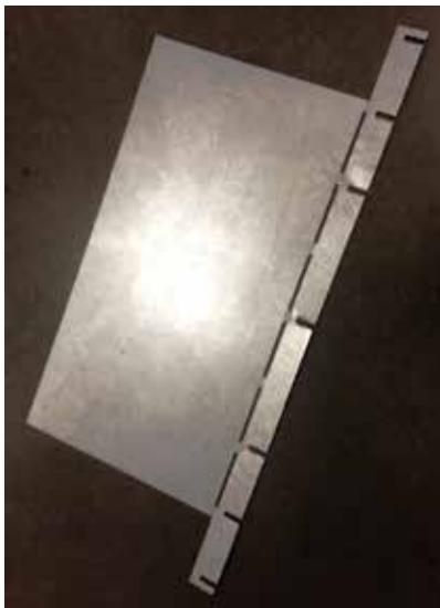
Figure 1 - Heat Shield