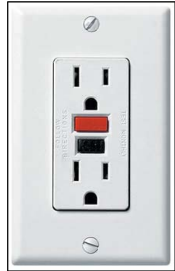
GFCI Socket – Do NOT use

The average surge protector that you purchase off of the shelf is rated for 330 volts and 18 amps. What this means in practical terms is that the surge protector will only stop the electricity if it is higher than 330 volts or 18 amps. Although this is better than not using any surge protector, you can get added protection by purchasing one that is rated differently. Try and get a surge protector that is rated for 130 volts and 7 amps. The closer to these ratings you can get, the more protection you are providing for your stove.