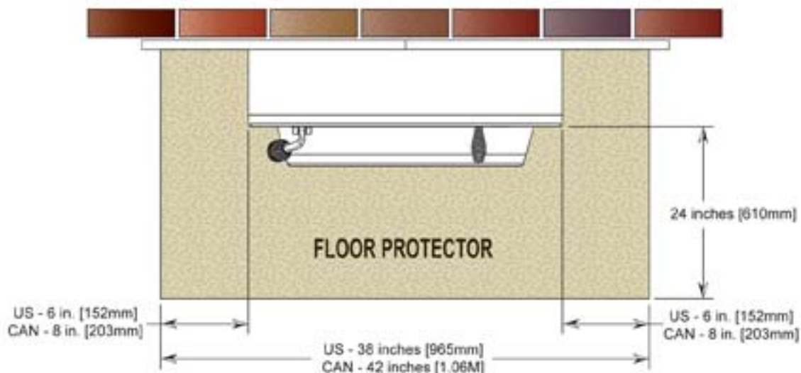
Minimum Floor Protector Specifications